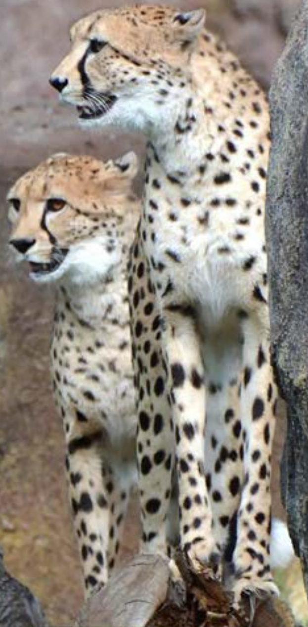
Leipzig Zoo Kiwara Kopje