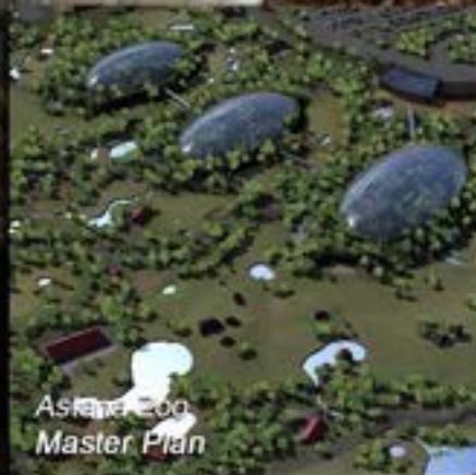
Asana Zoo Master Plan