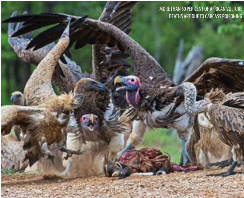
MORE THAN 60 PER CENT OF AFRICAN VULTURE DEATHS ARE DUE TO CARCASS POISONING

a well-informed multi-species action plan, targeting with priority those areas where the situation is most critical.