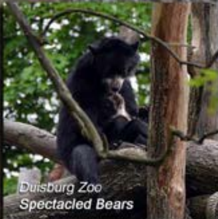
Duisburg Zoo Spectacled Bears