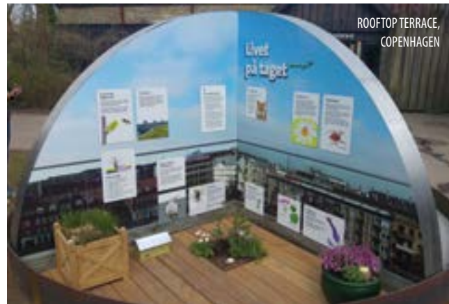
ROOFTOP TERRACE, COPENHAGEN

In recognition of this challenge, one of the aims of the Let It Grow campaign is to create and collect resources that focus on this communication challenge. At the end of the campaign the goal is to have created a resource that members can use to address the issue of biodiversity loss for many years to come. After all, the knowledge, experience and commitment to be found amongst EAZA, BGI and Ecsite members is the key reason why this campaign will be a success.