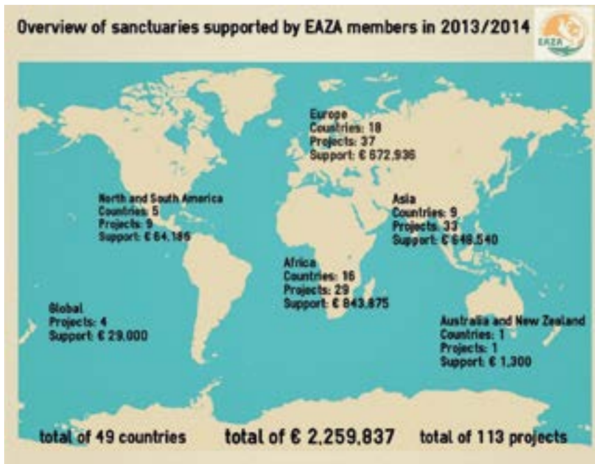
SUMMARY OF PROJECTS AND FINANCIAL SUPPORT SPLIT PER CONTINENT FOR 2013 AND 2014 BY EAZA MEMBERS

are situated within the EAZA region, covering 18 countries. The established and supported projects are as diverse as the EAZA membership, ranging from sanctuaries established on the grounds of EAZA Members to complex