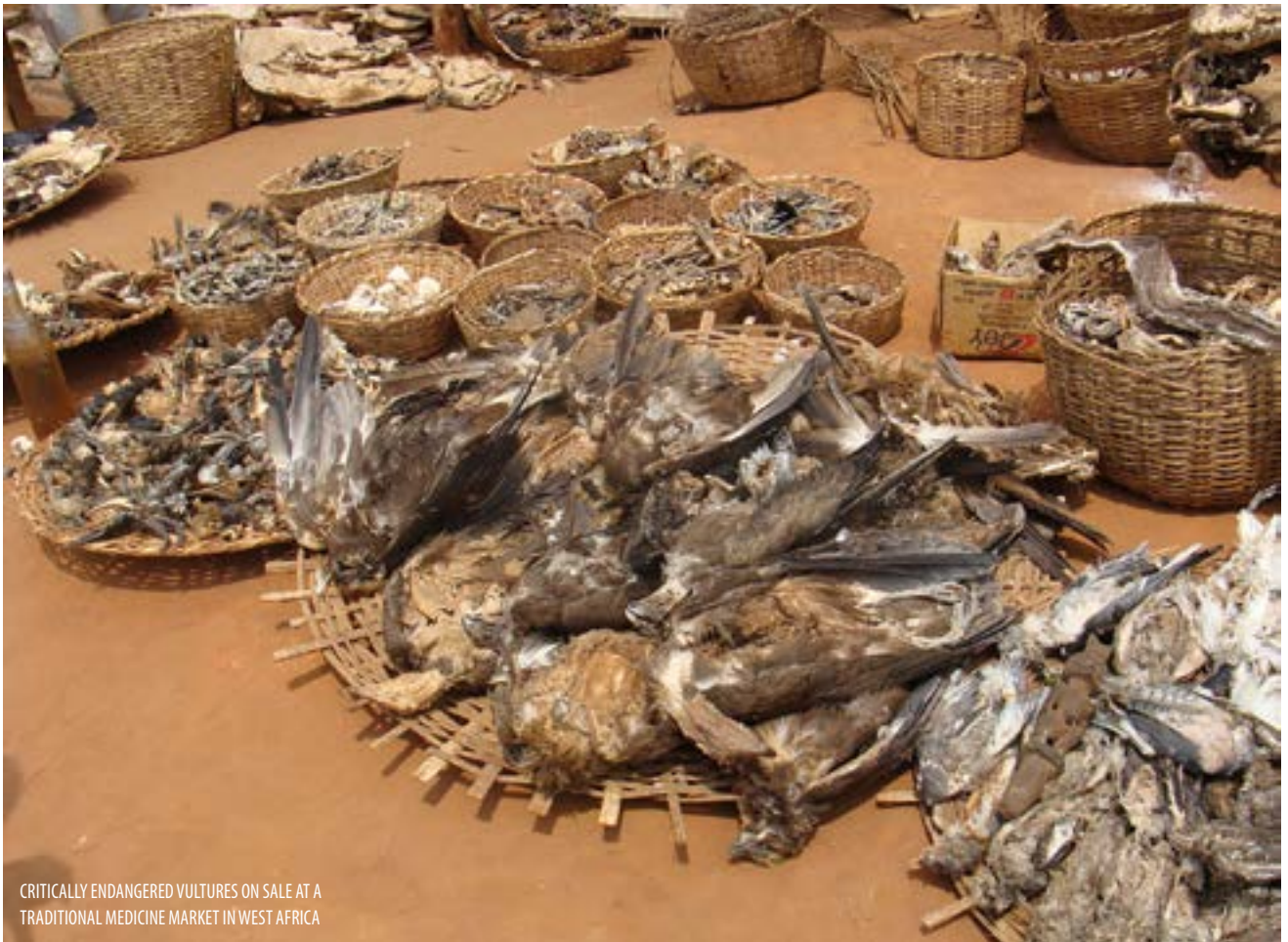
CRITICALLY ENDANGERED VULTURES ON SALE AT A TRADITIONAL MEDICINE MARKET IN WEST AFRICA