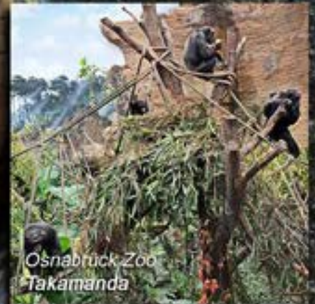
Osnabrück Zoo Takamanda