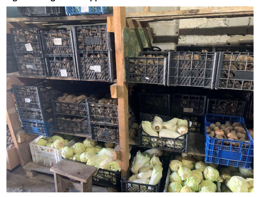
Figure 5: Fruit and vegetables for Kyiv Zoo