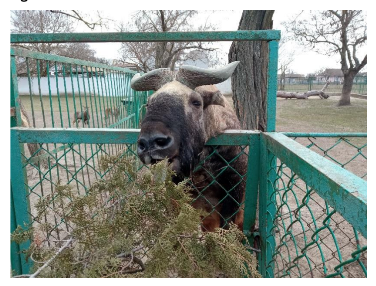
Figure 3: Shelter and food for animals in Askania Nova Reserve

The Fund remains open however, the majority has now been spent out. Calls for donations will continue and EAZA remains committed to supporting zoos and aquariums in Ukraine care for their animals and staff.