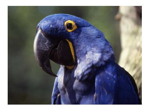
Figure 20 Hyacinthine macaws reach sexual maturity at 5 - 6 years

Some species such as the Hyacinthine macaw ( Anodorhynchus hyacinthinus ) (figure 20), have a number of years before they reach sexual maturity. It could be beneficial to the bird as well as the educational messages that could be included within live interpretation if it could be flown and exercised before entering a breeding program. For this particular species, its social needs still need the same considerations as any other of its species. Free flight may also work to enhance pair bonds before breeding if the birds were flown together.