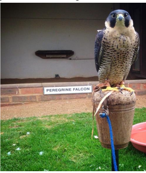
Figure 10 showing a peregrine on an appropriate block perch