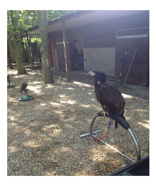
Figure 11 showing a rubber topped bow perch. Note the large ring that slides over the top of the perch