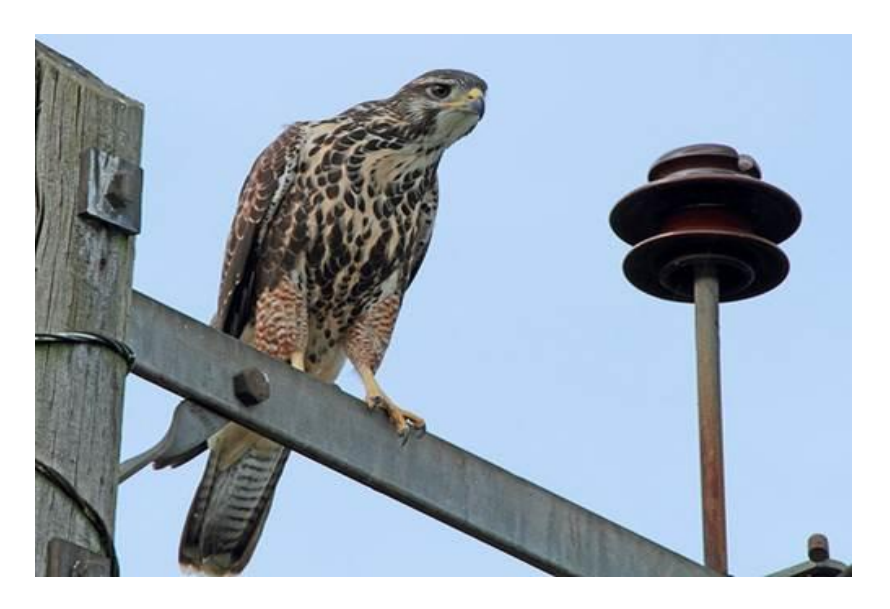
Figure 19 A hybrid between an escaped harris hawk and a wild buzzard in the UK

Escaped birds can cause detrimental environmental impact if not retrieved. Many raptors are shot if they happen to fly near shoots and predate upon game birds or racing pigeons where as other birds, particularly flocking species are extremely difficult to manage if escaped.