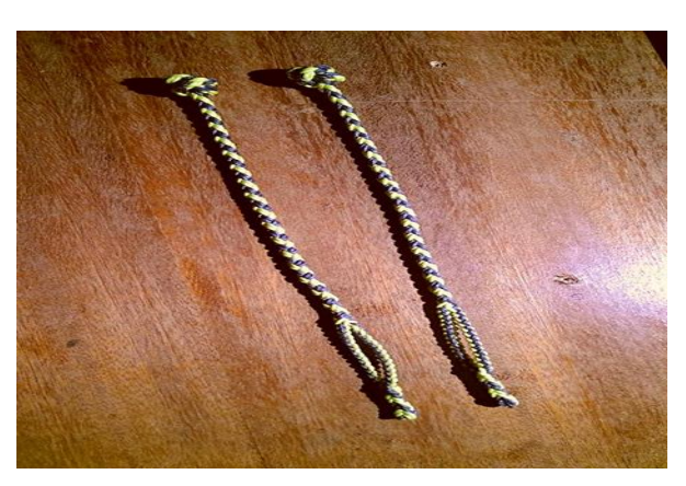
Figure 8 - braided "mews" jesses