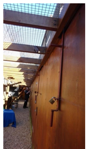
Figure 7 showing the locked slide release

• Flying birds directly from an aviary is also less restrictive in terms of species that can be included in a display. During warmer months many temperate species can get too warm if placed in a box for any more than 15 minutes. Efforts should be made to exclude such species from a show if there is no alternative method of flying them.