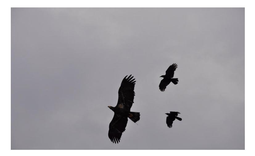
Figure 9. A juvenile bald eagle being mobbed by two crows in a display

with the display bird. This is particularly common when flying the male of the species. It is not unusual for this bird to be excluded from displays so as not to affect the breeding and territorial behaviour of wild counterparts.