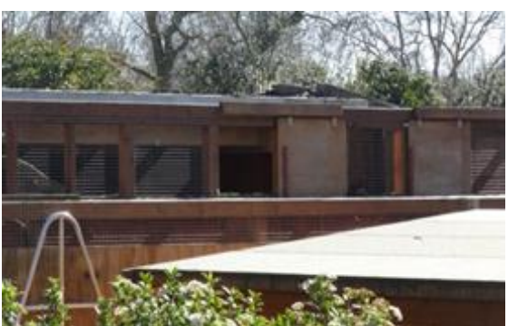
Figures 5 and 6