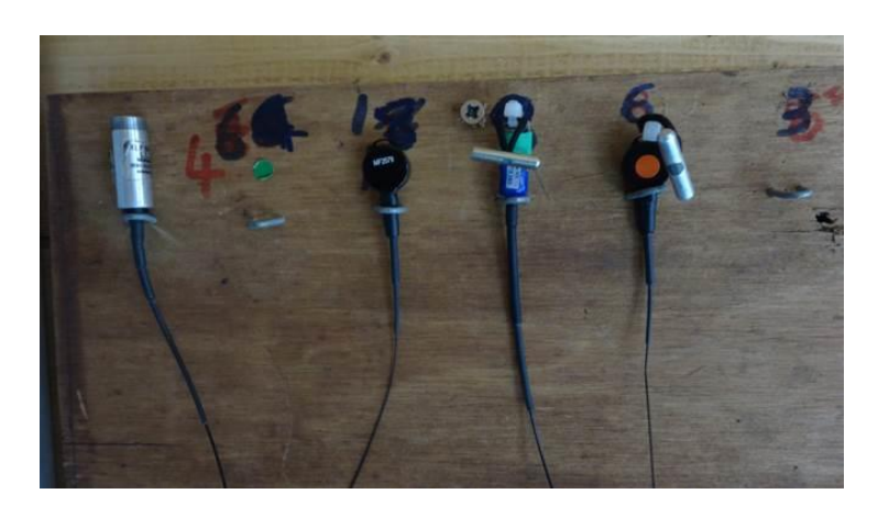
Figure 15 showing a number of different transmitters. The small toggles in this case go through the eyelets on a raptors anklets

The fitting of a transmitter can be achieved in a number of ways. It may be attached to the anklet on many hawks for example using a tightly closed zip tie (not too tight that it can't be cut off easily but tight enough to prevent a loop that may get snagged) or it may be "tail mounted" using a tail mount attached to the base of the quill of a central deck feather. This method means that the transmitter is not hanging below the bird's leg as it flies and aesthetically looks neater. It also means that it is less likely to hit anything as the bird is flying causing potential injury. This method of attachment is commonly used on falcons. The obvious downside to this is if a bird begins to moult and shed a feather. This could and has resulted in a shed transmitter. For this reason, tail mounts can be made that attach to two feathers to minimise the risk of this happening.