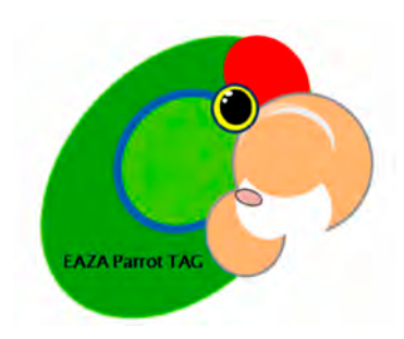
NEW PARROT TAG LOGO. DESIGNED BY SIMON BRUSLUND, HEIDELBERG ZOO

A logo for the Parrot TAG has been adopted. It consists of many circles coming together (symbolic of a TAG) along with prominent parrot characteristics such as vivid colours, hooked bill and adapted tongue.