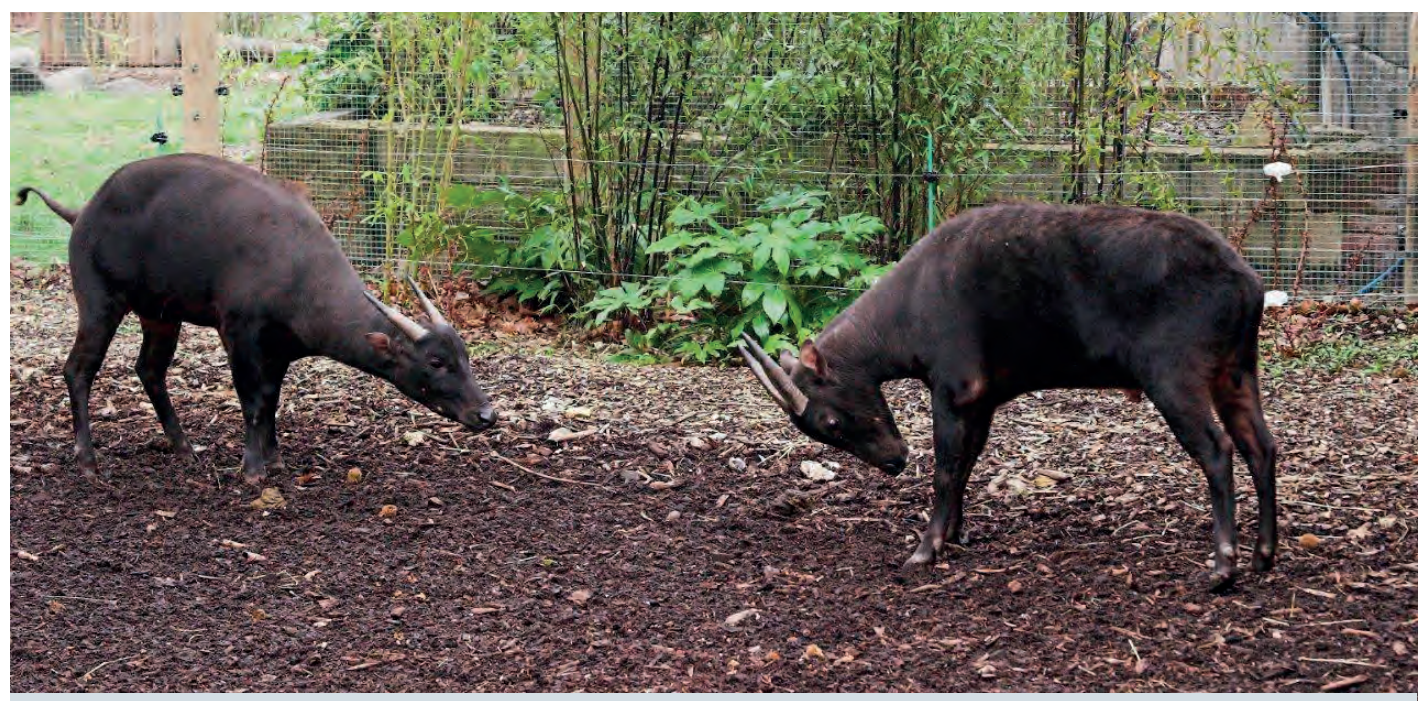
A PAIR OF ANOA (BUBALIS DEPRESSICORNIS)