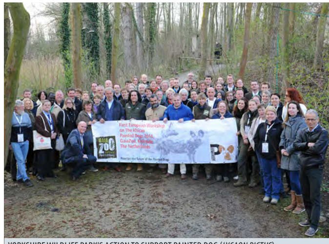
YORKSHIRE WILDLIFE PARK'S ACTION TO SUPPORT PAINTED DOG (LYCAON PICTUS) CONSERVATION IN HWANGE NATIONAL PARK, ZIMBABWE

The TAG held a meeting at Avifauna, Netherlands on 14th June 2014. This was part of the EAZA joint TAG Chairs meeting. The Canid and Hyaenid TAG meeting was attended by representatives from the EAZA, AZA (Associations of Zoos and Aquariums), ZAA (Zoo and Aquarium Association), PAAZA (Pan African Association of Zoos and Aquariums)