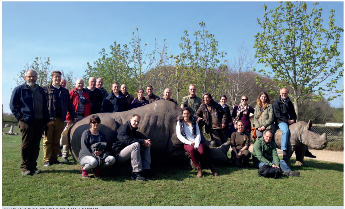
2014 BLACK RHINO HUSBANDRY WORKSHOP