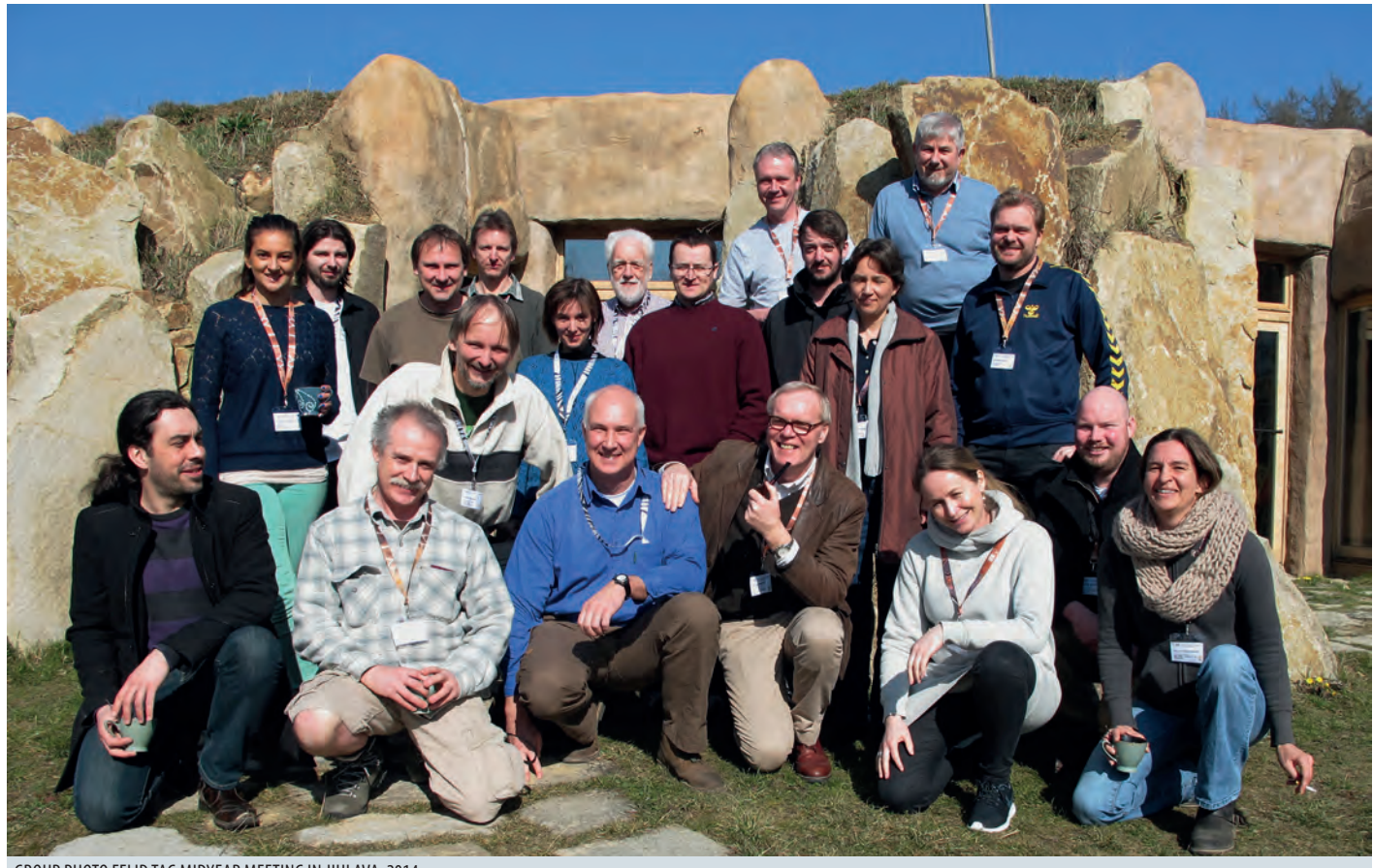
GROUP PHOTO FELID TAG MIDYEAR MEETING IN JIHLAVA, 2014

TAGs will work together to compile photographs and collect DNA samples.