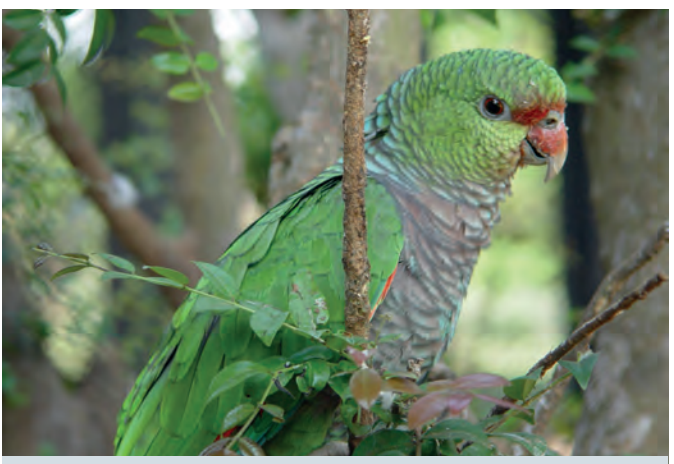
VINACEOUS-BREASTED AMAZON AT THE LYMINGTON FOUNDATION, BRAZIL

The number of Parrot TAG advisors who can assist in specialist areas was expanded – they are as follows: