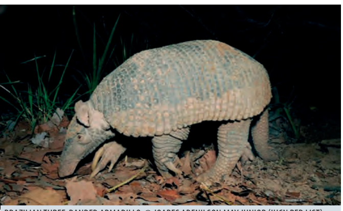
BRAZILIAN THREE-BANDED ARMADILLO

In 2013, the Small Mammal TAG had its mid-year meeting in Cotswold Wildlife Park (United Kingdom). Cotswold Wildlife Park did an outstanding job of hosting the meeting. The TAG members gave very interesting presentations on different small mammals, provided updates on their breeding programs and shared information about relevant conservation projects. Interesting presentations included: Naked mole rats in Bristol Zoo; An overview of a decade of small mammals in UK and