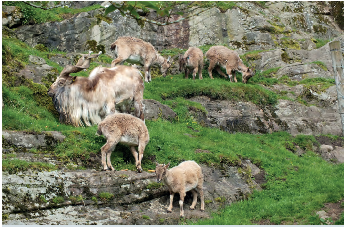
MARKHOR HERD, KINGUSSIE

in Europe and the steady interest and some growth in North America, we opted to manage the two populations as one and that the combined programme would be managed by our American colleagues. We are looking to further enhance our links and we envisage producing a combined and heavily revised collection plan that covers both of our regions. This growing level of cooperation is of course logical, but the current import legislation makes animal movements very difficult between our two regions, especially into the USA. We are actively moving forward with solutions that will enable easier movement of animals and the importation of two unrelated Szechuan takin females and a male Japanese serow from the USA demands that we reciprocate.