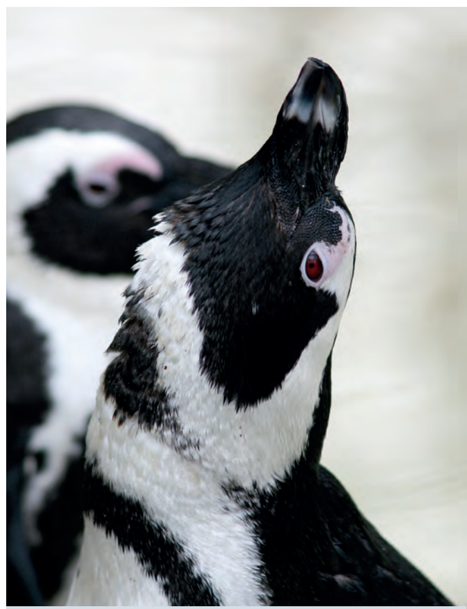
AFRICAN PENGUIN (SPHENISCUS DEMERSUS) AT ARTIS ROYAL ZOO