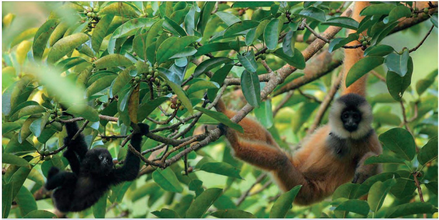
CAO VIT GIBBON

to breed in order to have infant animals in their groups. However, for this long-lived group of species, which have very small family units, continued breeding creates a problem which will affect us for the next 40 years and is not sustainable. The TAG, along with our international counterparts, discussed this at length at the Joint mid-year meeting to plan a global strategy to manage the affected species populations, so it is hoped that the RCP will help greatly in managing this problem into the future. This of course will only be achieved with the cooperation of the holders.