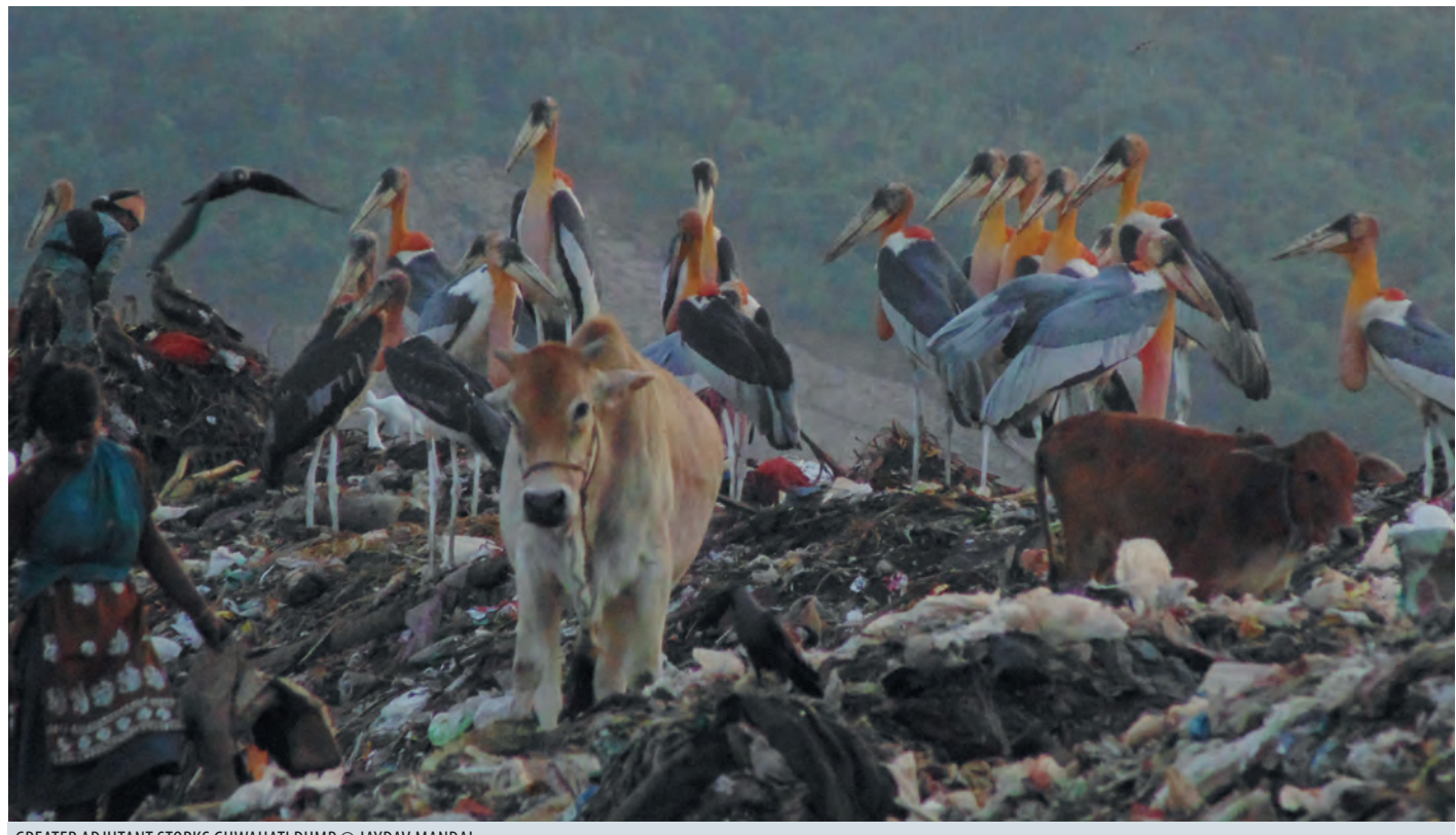
GREATER ADJUTANT STORKS GUWAHATI DUMP

these institutions, we first had to get some idea of the level of feasibility of the project, and as the need for the influx of wild birds into existing captive populations was taken as a drawn conclusion without the provision of any solid scientific evidence, the TAGs all disassociated themselves from this project proposal.