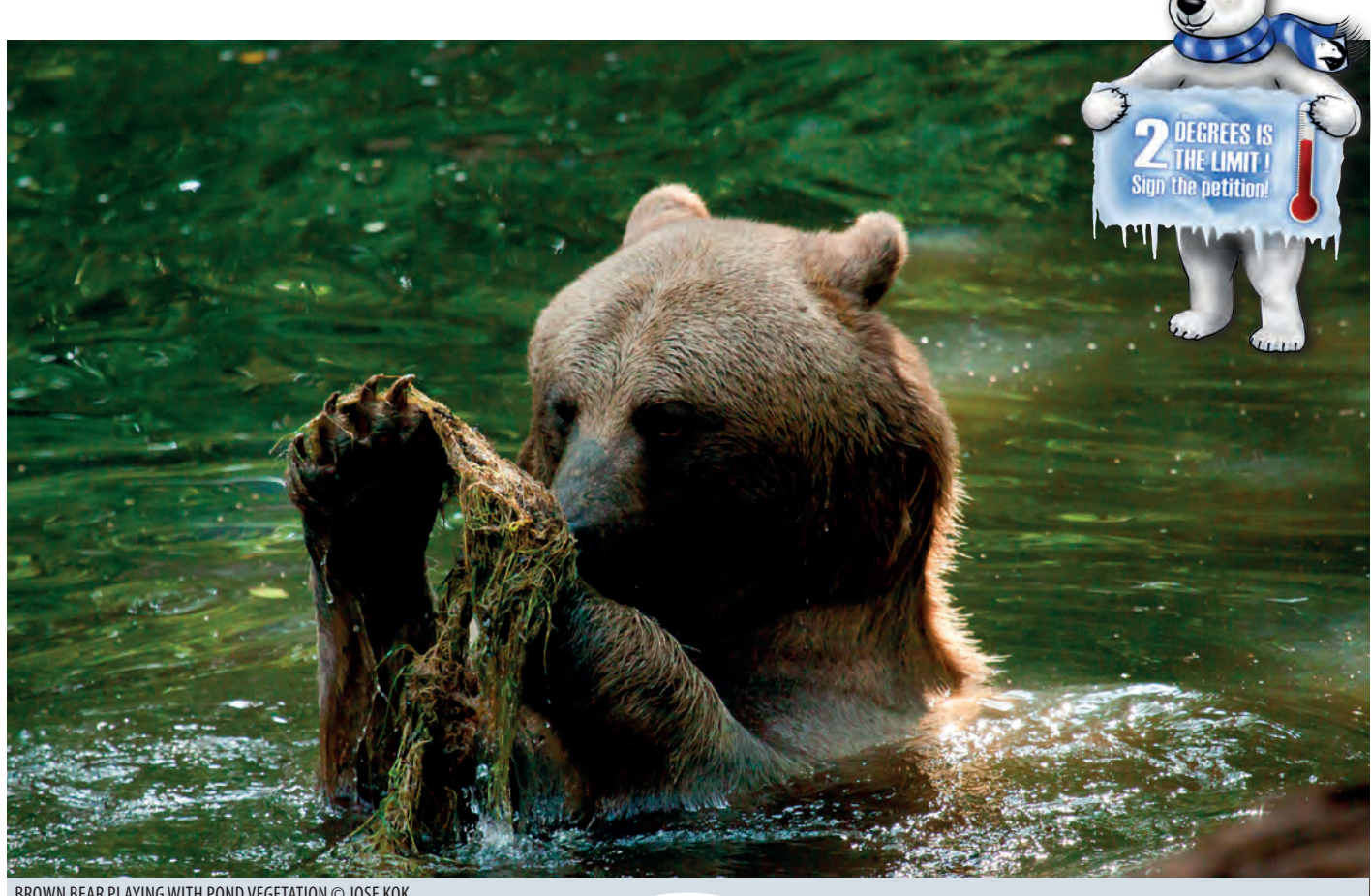
BROWN BEAR PLAYING WITH POND VEGETATION

black bears live. Losses are replaced by occasional breeding.