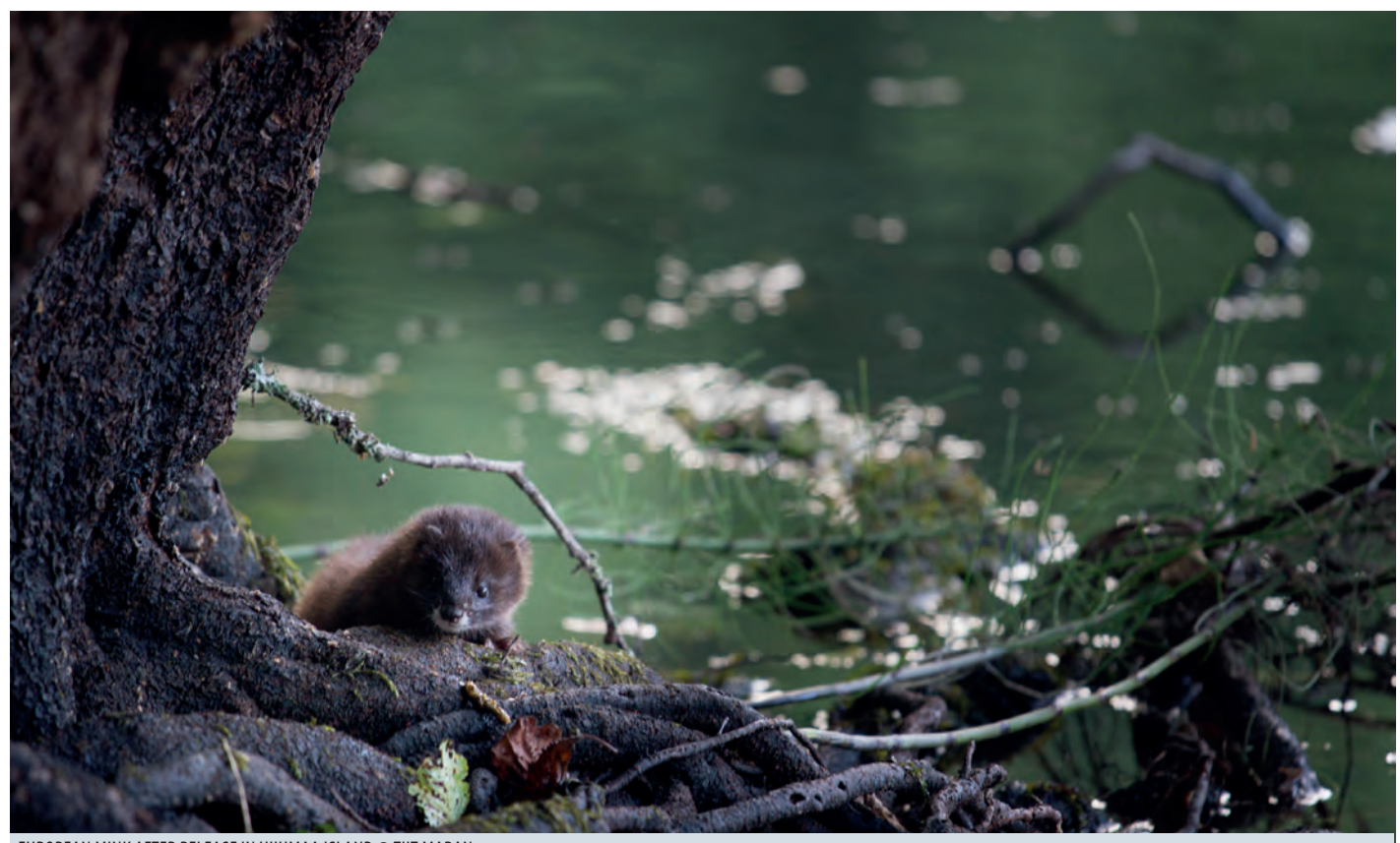
EUROPEAN MINK AFTER RELEASE IN HIIUMAA ISLAND