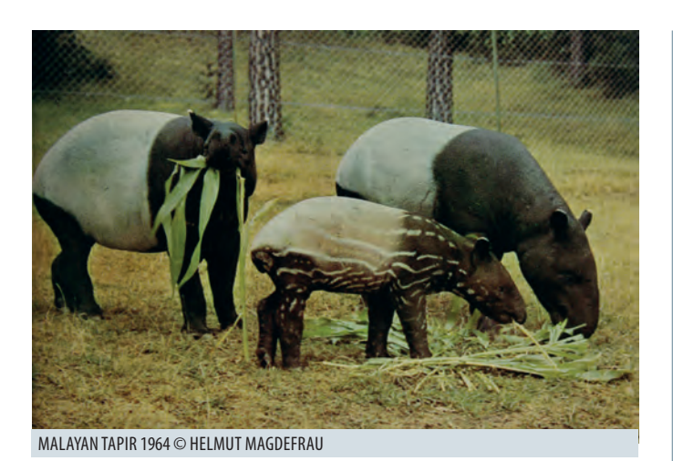
result of the evaluation was published in spring 2014 with the marks "sufficient – good" and with recommendations to distribute workload, to produce a Regional Collection Plan and Best Practice Guidelines and to continue work on EEP improvements.