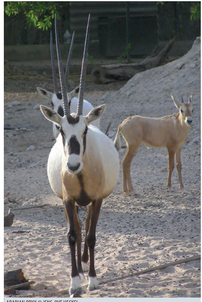
ARABIAN ORYX