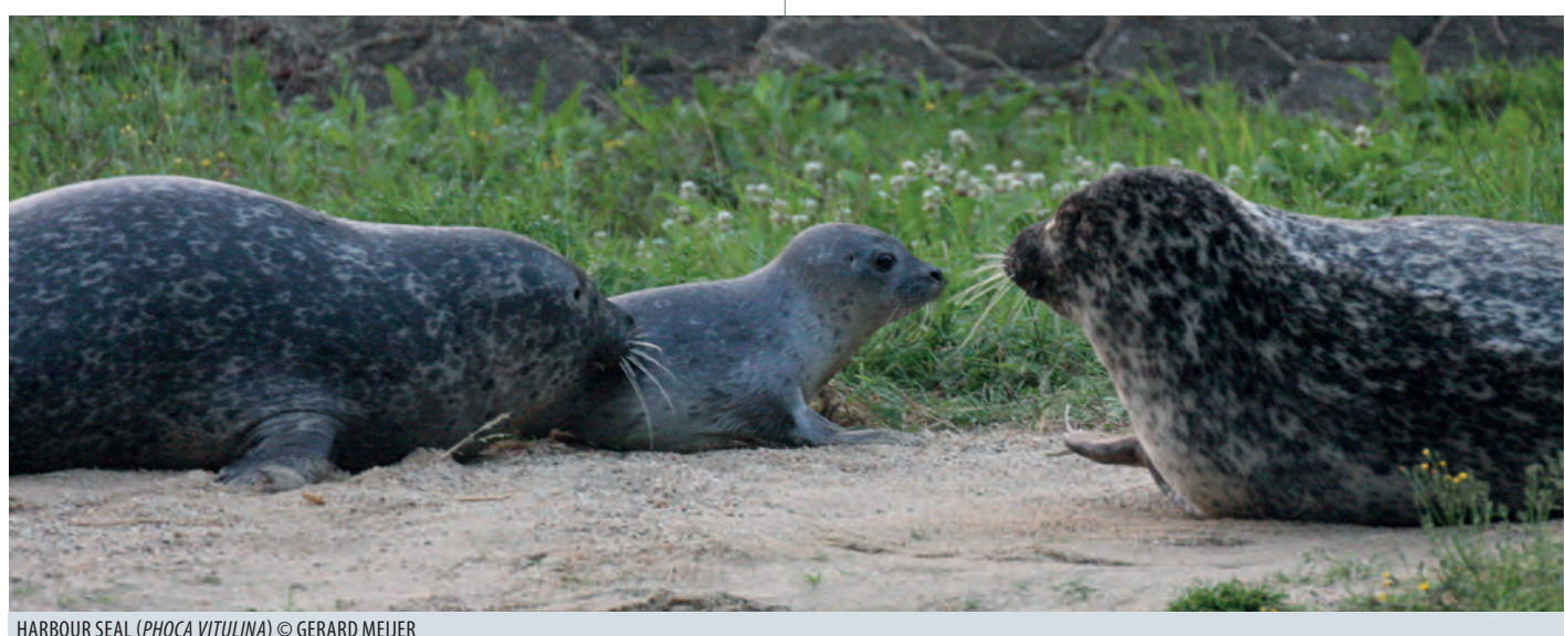
HARBOUR SEAL (PHOCA VITULINA)

The Marine Mammal TAG has been working on new Best