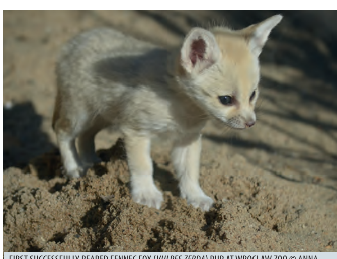
FIRST SUCCESSFULLY REARED FENNEC FOX ( VULPES ZERDA ) PUP AT WROCLAW ZOO

All these programmes will be assessed and formal planning will take place in March 2016 at Henry Doorly Zoo and Aquarium in Nebraska, USA.