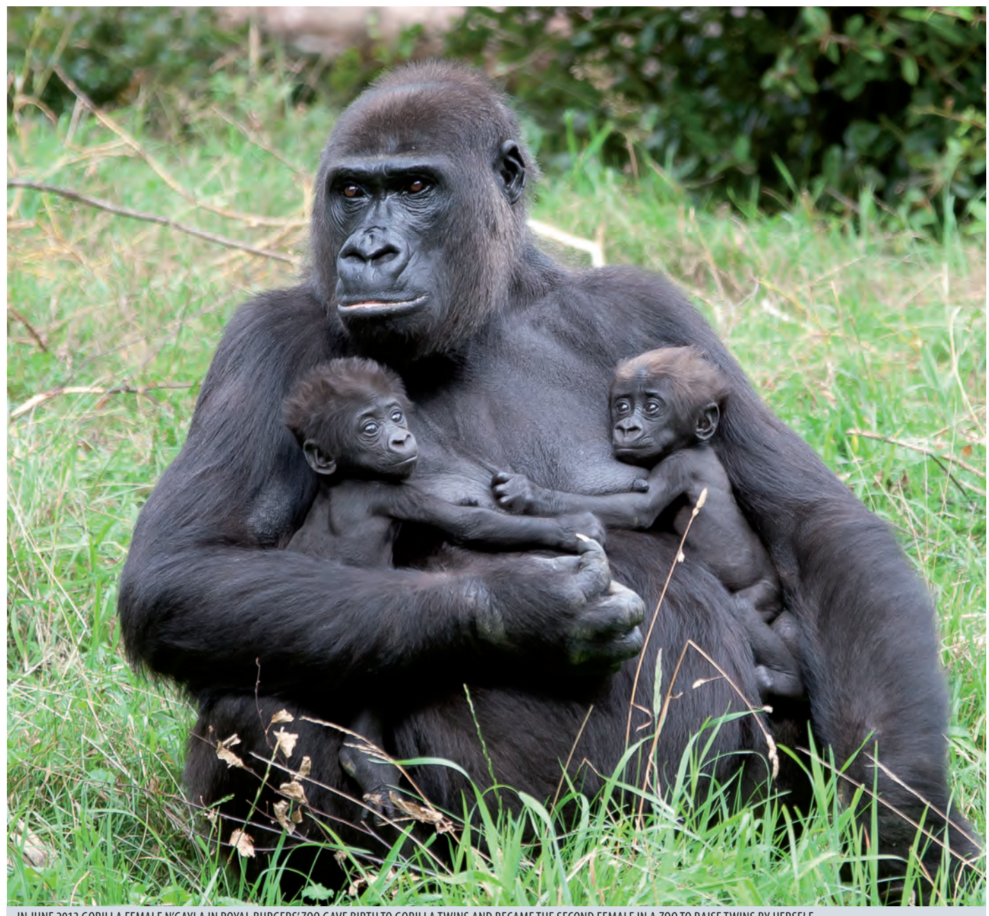
IN JUNE 2013 GORILLA FEMALE N'GAYLA IN ROYAL BURGERS'ZOO GAVE BIRTH TO GORILLA TWINS AND BECAME THE SECOND FEMALE IN A ZOO TO RAISE TWINS BY HERSELF