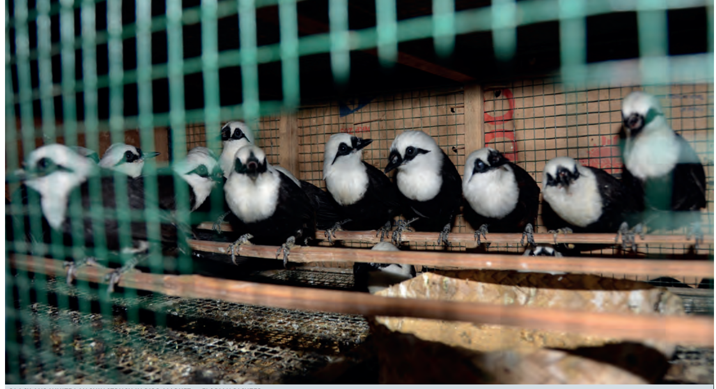
BLACK AND WHITE LAUGHINGTRUSH IN BIRD MARKET

support in situ conservation efforts. The situation of the Bali Starling epitomises what is a gathering threat to many Asian songbird species; excessive trapping for caged birds is wiping out whole songbird populations and for a growing list of species threating their existence. This presents a major conservation challenge and what makes the task for TSAWG so vitally important. For a number of these species if captive programmes are not established, the future for the entire species is very bleak.