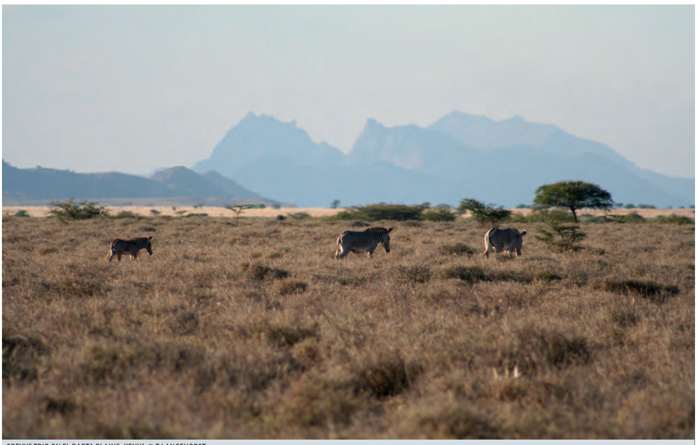
GREVYS TRIO ON EL BARTA PLAINS, KENYA